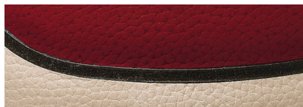
New color of the genuine leather and new shape of the pebbles

All lettering design on the BG5000 is branded into the ball to offer an authentic look to the natural leather basketball.