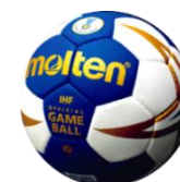
X5000 standard model

Molten's X5000 Handball features a premium cover material which provides exceptional grip, improved ball control, and accuracy, making it an ideal choice for the highest level of competition.