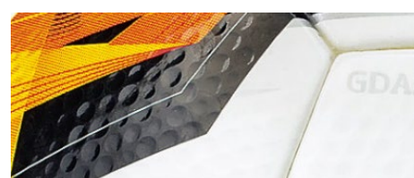
Dimples on the ball surface

The dimples on the surface of the ball reduce turbulence and stabilize it while in flight. This enhances ball control, resulting in more accurate passes and shots. (F5U5003-K0)