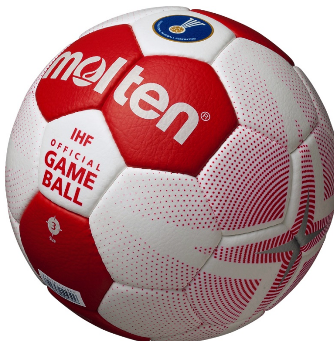
NUEVA X5000 IHF Special Edition

Molten Corporation (headquarters: Nishi-ku, Hiroshima City, Japan; President and CEO: KiyoTamiaki), a manufacturer of competition quality sports balls and equipment, will supply the NUEVA X5000 IHF Special Edition ball as the official ball for the IHF TOKYO HANDBALL QUALIFICATION 2020 (Women: March 2020–22, 2020 in Spain, Hungary and Montenegro; Men: April 17–19 in France, Germany and Norway) during which the teams will play to secure one of the remaining 6 slots for the Olympic Games. The special edition carries the same features of the flagship model, NUEVA X5000, which is the official game ball of the International Handball Federation (IHF). The ball was developed in pursuit of an exceptional grip.