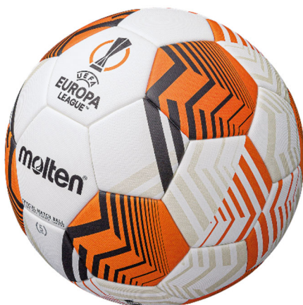
Design based on an image of innovative spirit and strength

The official match balls for both UEL and UECL were designed based on the same concept of "energy wave (passion of the players, staff and fans)." However, the energy wave of each league incorporates the unique characteristics of the competition and the shape of the trophies. The UEL official match ball was designed based on the innovative spirit and strength of the competition, while the UECL official match ball was designed based on the geometric curves of the trophy.