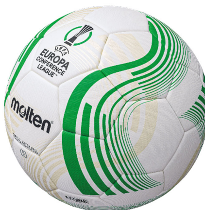
Design characterized by geometric curves