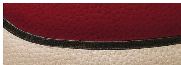
New color of the genuine leather and new shape of the pebbles

BG5000 takes full advantage of the natural leather properties to ensure better texture. All lettering design on the BG5000 is branded into the ball to offer an authentic look to the natural leather basketball.