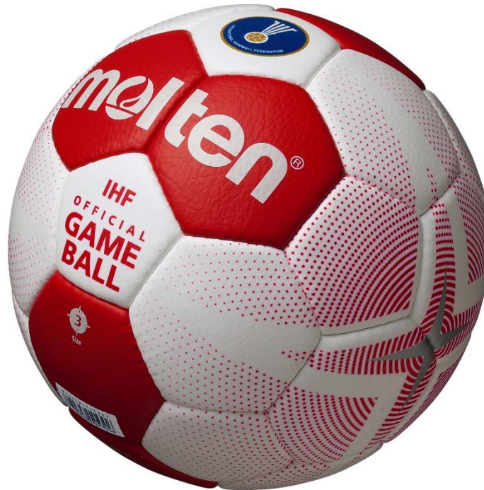
NUEVA X5000 IHF Special Edition

Molten Corporation (headquarters: Nishi-ku, Hiroshima City, Japan; President and CEO: Kiyotamiaki), a manufacturer of competition quality sports balls and equipment, will supply the NUEVA X5000 IHF Special Edition ball as the official ball for the IHF TOKYO HANDBALL QUALIFICATION 2020 (Women: March 2020–22, 2020 in Spain, Hungary and Montenegro; Men: April 17–19 in France, Germany and Norway) during which the teams will play to secure one of the remaining 6 slots for the Olympic Games. The special edition carries the same features of the flagship model, NUEVA X5000, which is the official game ball of the International Handball Federation (IHF). The ball was developed in pursuit of an exceptional grip.